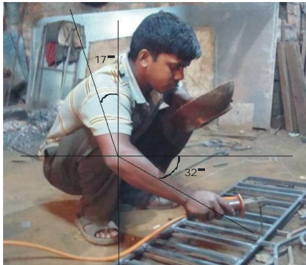
Fig. 1: Upper and Lower Arm Angle

From fig.1 & 2 the score has been obtained from RULA work sheet by observing upper & lower arm angle of the welder. The shoulder of workers gets raised and arms get abducted also, so it gives score of '1' individually and it will be get added to the previous score while working. So the final upper arm score is '4'. In the same way for lower arm, by selecting the mannequin score of '2' has been obtained and as the arm is working across midline of the body and from the fig.2, position of wrist has been observed and by selecting the related location of the wrist from the worksheet we get the score of 1 While working the wrist bent from the midline which gives the score of '1' and this is added to the previous score and the final wrist score is '3'. Here welding is of continuous type so for this type of welding the wrist twist position score is '2'. After getting these four scores, the posture score-A (part-A) is 5 that can be calculated and evaluated from RULA assessment work sheet. This score will have to be further added to muscle and force/load score for ultimate and grand score of Part-A. Muscle score of '1' has been found as the posture is mainly static and the welding action is repetitive. The load of welding gun is of around 2.5