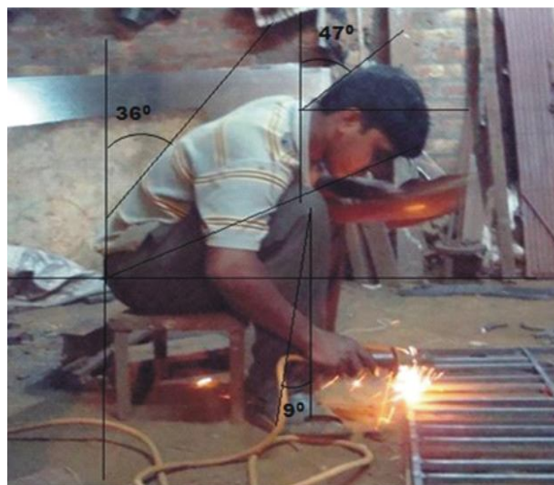
Fig. 3: Forward bending angle neck and leg angle

previous score of trunk and it gives the final score for trunk as 3'. The worker works on both of their legs so it gives score for limb as '1'. So from the RULA