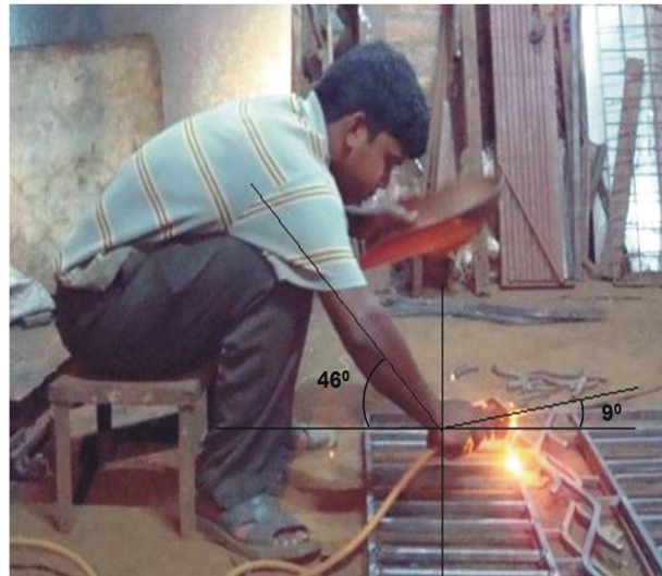
Fig. 2: Lower Arm angle and Abduction Angle

By observing the neck angle of the worker, the calculated posture score is '3'. Now the neck twist that is for, continuous welding operation has to twist till the end of the welding length so it gives score of '1' which will get added to previous score of neck. So the final score of neck is '4'. From fig 3, it can be observed that the angle of posture of trunk of worker and related to that the mannequin is selected and it gives the score of '2'. The score of '1' individually for trunk twist and trunk side bend is added to the